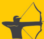
Archery Game *